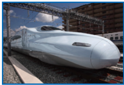
Sanyō & Kyūshū Shinkansen "SAKURA" Sanyō Shinkansen (622.3 km) Train Names: NOZOMI*, MIZUHO*, HIKARI (incl. HIKARI Rail Star), SAKURA, KODAMA (Tokyo thru Hakata, 1,174.9km)