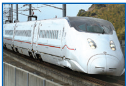
Kyūshū Shinkansen "Series 800" Kyūshū Shinkansen (288.9 km) Train Names: MIZUHO*, SAKURA, TSUBAME