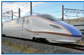
Hokuriku Shinkansen "KAGAYAKI" etc. Hokuriku Shinkansen (450.5 km) Train Names: KAGAYAKI, HAKUTAKA, TSURUGI, ASAMA