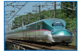
Tōhoku Shinkansen "HAYABUSA", "YAMABIKO", etc. Tōhoku Shinkansen (713.7 km) Train Names: HAYABUSA, HAYATE, YAMABIKO, NASUNO