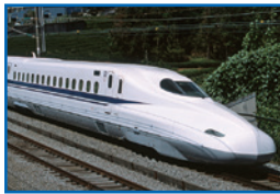
Tōkaidō & Sanyō Shinkansen "HIKARI" Tōkaidō Shinkansen (552.6 km) Train Names: NOZOMI*, HIKARI, KODAMA