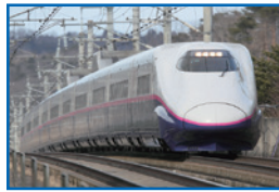
Jōetsu Shinkansen "TOKI" etc Jōetsu Shinkansen (333.9 km) Train Names: TOKI, TANIGAWA Max-TOKI, Max-TANIGAWA