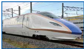
Hokuriku Shinkansen "KAGAYAKI" etc. Hokuriku Shinkansen (450.5 km) Train Names: KAGAYAKI, HAKUTAKA, TSURUGI, ASAMA