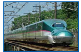
Tōhoku Shinkansen "HAYABUSA," "YAMABIKO" etc. Tōhoku Shinkansen (713.7 km) Train Names: HAYABUSA, HAYATE, YAMABIKO, NASUNO