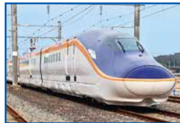
Yamagata Shinkansen "TSUBASA" Yamagata Shinkansen (421.4 km) Train Name: TSUBASA