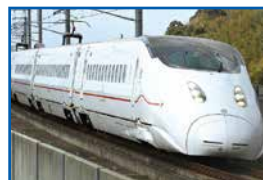
Kyūshū Shinkansen "Series 800" Kyūshū Shinkansen (288.9 km) Train Names: MIZUHO*, SAKURA, TSUBAME