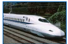
Tōkaidō & Sanyō Shinkansen "HIKARI" Tōkaidō Shinkansen (552.6 km) Train Names: NOZOMI*, HIKARI, KODAMA