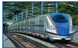
Jōetsu Shinkansen "TOKI" etc. Jōetsu Shinkansen (333.9 km) Train Names: TOKI, TANIGAWA