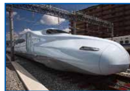
Sanyō & Kyūshū Shinkansen "SAKURA" Sanyō Shinkansen (622.3 km) Train Names: NOZOMI*, MIZUHO*, HIKARI (incl. HIKARI Rail Star), SAKURA, KODAMA (Tokyo thru Hakata, 1,174.9km)

* There are six types of train services, "NOZOMI," "MIZUHO," "HIKARI," "SAKURA," "KODAMA" and "TSUBAME" trains on the Tōkaidō, Sanyō and Kyūshū Shinkansen, and the stations at which trains stop vary with train types. The JAPAN RAIL PASS is only valid for "HIKARI," "SAKURA," "KODAMA" and "TSUBAME" trains, and not valid for any seats, reserved or non-reserved, on "NOZOMI" and "MIZUHO" trains. To travel on the Tōkaidō, Sanyō and Kyūshū Shinkansen, the pass holders must take "HIKARI," "SAKURA," "KODAMA" or "TSUBAME" trains, or pay the basic fare and the Shinkansen express charge to take "NOZOMI" and "MIZUHO" trains. However, if a JAPAN RAIL PASS holder additionally purchases an [ONLY WITH JAPAN RAIL PASS] NOZOMI MIZUHO Ticket (hereinafter referred to as a "NOZOMI MIZUHO Ticket") before boarding the train, the JAPAN RAIL PASS holder may use a "NOZOMI" or "MIZUHO" trains.