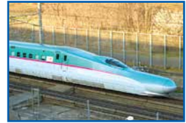
Hokkaido Shinkansen "HAYABUSA" etc. Hokkaido Shinkansen (148.8 km) Train Names: HAYABUSA, HAYATE