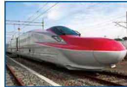
Akita Shinkansen "KOMACHI" Akita Shinkansen (662.6 km) Train Name: KOMACHI