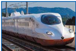
Nishi Kyūshū Shinkansen "KAMOME" Nishi Kyūshū Shinkansen (69.6km) Train Names: KAMOME