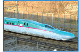
Hokkaido Shinkansen "HAYABUSA" etc. Hokkaido Shinkansen (148.8 km) Train Names: HAYABUSA, HAYATE