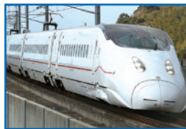
Kyūshū Shinkansen "Series 800" Kyūshū Shinkansen (288.9 km) Train Names: MIZUHO*, SAKURA, TSUBAME