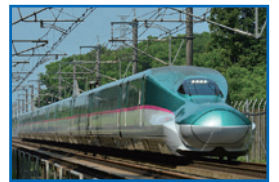
Tōhoku Shinkansen "HAYABUSA," "YAMABIKO" etc. Tōhoku Shinkansen (713.7 km) Train Names: HAYABUSA, HAYATE, YAMABIKO, NASUNO