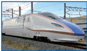
Hokuriku Shinkansen "KAGAYAKI" etc. Hokuriku Shinkansen (450.5 km) Train Names: KAGAYAKI, HAKUTAKA, TSURUGI, ASAMA