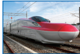
Akita Shinkansen "KOMACHI" Akita Shinkansen (662.6 km) Train Name: KOMACHI