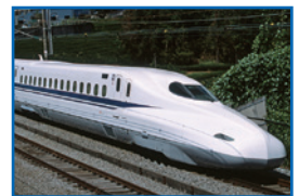
Tōkaidō & Sanyō Shinkansen "HIKARI" Tōkaidō Shinkansen (552.6 km) Train Names: NOZOMI*, HIKARI, KODAMA

* There are six types of train services, "NOZOMI," "MIZUHO," "HIKARI," "SAKURA," "KODAMA" and "TSUBAME" trains on the Tōkaidō, Sanyō and Kyūshū Shinkansen, and the stations at which trains stop vary with train types. The JAPAN RAIL PASS is only valid for "HIKARI," "SAKURA," "KODAMA" and "TSUBAME" trains, and not valid for any seats, reserved or non-reserved, on "NOZOMI" and "MIZUHO" trains. To travel on the Tōkaidō, Sanyō and Kyūshū Shinkansen, the pass holders must take "HIKARI," "SAKURA," "KODAMA" or "TSUBAME" trains, or pay the basic fare and the Shinkansen express charge to take "NOZOMI" and "MIZUHO" trains. However, if a JAPAN RAIL PASS holder additionally purchases an [ONLY WITH JAPAN RAIL PASS] NOZOMI MIZUHO Ticket (hereinafter referred to as a "NOZOMI MIZUHO Ticket") before boarding the train, the JAPAN RAIL PASS holder may use a "NOZOMI" or "MIZUHO" trains.