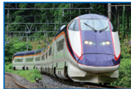
Yamagata Shinkansen "TSUBASA" Yamagata Shinkansen (421.4 km) Train Name: TSUBASA