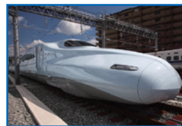
Sanyō & Kyūshū Shinkansen "SAKURA" Sanyō Shinkansen (622.3 km) Train Names: NOZOMI*, MIZUHO*, HIKARI (incl. HIKARI Rail Star), SAKURA, KODAMA (Tokyo thru Hakata, 1,174.9 km)