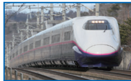
Jōetsu Shinkansen "TOKI" etc. Jōetsu Shinkansen (333.9 km) Train Names: TOKI, TANIGAWA Max-TOKI, Max-TANIGAWA