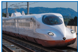
Nishi Kyūshū Shinkansen "KAMOME" Nishi Kyūshū Shinkansen (69.6 km) Train Names: KAMOME