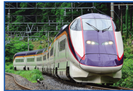
Yamagata Shinkansen "TSUBASA" Yamagata Shinkansen (421.4 km) Train Name: TSUBASA