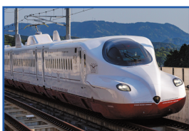
Nishi Kyūshū Shinkansen "KAMOME" Nishi Kyūshū Shinkansen (69.6km) Train Names: KAMOME