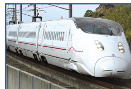
Kyūshū Shinkansen "Series 800" Kyūshū Shinkansen (288.9 km) Train Names: MIZUHO*, SAKURA, TSUBAME