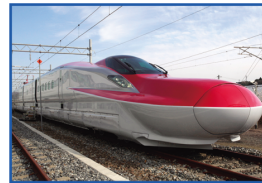
Akita Shinkansen "KOMACHI" Akita Shinkansen (662.6 km) Train Name: KOMACHI