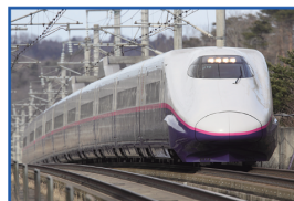
Jōetsu Shinkansen "TOKI" etc. Jōetsu Shinkansen (333.9 km) Train Names: TOKI, TANIGAWA Max-TOKI, Max-TANIGAWA