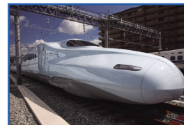
Sanyō & Kyūshū Shinkansen "SAKURA" Sanyō Shinkansen (622.3 km) Train Names: NOZOMI*, MIZUHO*, HIKARI (incl. HIKARI Rail Star), SAKURA, KODAMA (Tokyo thru Hakata, 1,174.9km)

* There are six types of train services, "NOZOMI," "MIZUHO," "HIKARI," "SAKURA," "KODAMA" and "TSUBAME" trains on the Tōkaidō, Sanyō and Kyūshū Shinkansen, and the stations at which trains stop vary with train types. The JAPAN RAIL PASS is only valid for "HIKARI," "SAKURA," "KODAMA" and "TSUBAME" trains, and not valid for any seats, reserved or non-reserved, on "NOZOMI" and "MIZUHO" trains. To travel on the Tōkaidō, Sanyō and Kyūshū Shinkansen, the pass holders must take "HIKARI," "SAKURA," "KODAMA" or "TSUBAME" trains, or pay the basic fare and the Shinkansen express charge to take "NOZOMI" and "MIZUHO" trains (see p.7 and p.8 for details).