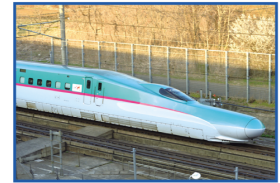
Hokkaido Shinkansen "HAYABUSA" etc. Hokkaido Shinkansen (148.8 km) Train Names: HAYABUSA, HAYATE

Can also be Used for Shinkansen “bullet train” Travel