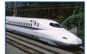
Tōkaidō & Sanyō Shinkansen "HIKARI" Tōkaidō Shinkansen (552.6 km) Train Names: NOZOMI*, HIKARI, KODAMA