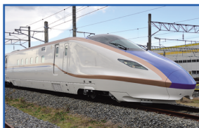
Hokuriku Shinkansen "KAGAYAKI" etc. Hokuriku Shinkansen (450.5 km) Train Names: KAGAYAKI, HAKUTAKA, TSURUGI, ASAMA