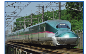
Tōhoku Shinkansen "HAYABUSA," "YAMABIKO," etc. Tōhoku Shinkansen (713.7 km) Train Names: HAYABUSA, HAYATE, YAMABIKO, NASUNO