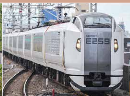
NARITA EXPRESS (N'EX)

Narita Airport - Tōkyō / Shibuya / Shinjuku Shinagawa / Yokohama / Ōfuna