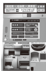
Image of a reserved seat ticket machine